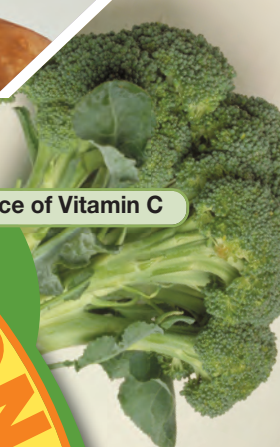
source of Vitamin C